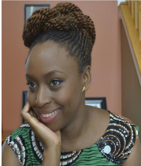
Chimamanda Ngozi Adichie