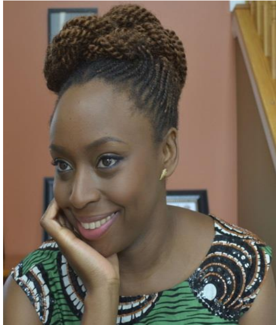
Chimamanda Ngozi Adichie